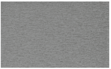
Gray Zinc Matte®