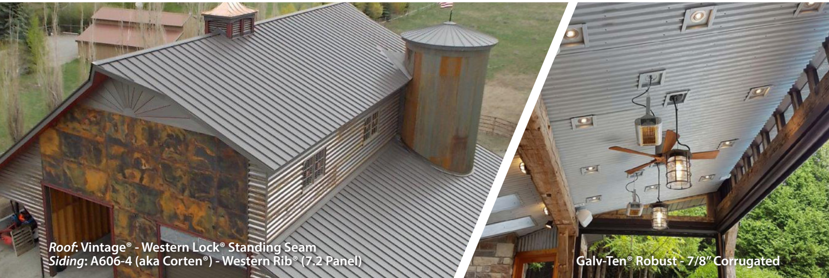
Roof: Vintage® - Western Lock® Standing Seam Siding: A606-4 (aka Corten®) - Western Rib® (7.2 Panel)