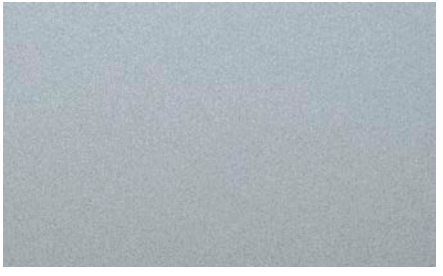
Matte Zinc Metallic®