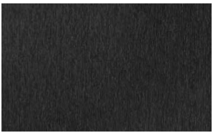
Black Zinc Matte®