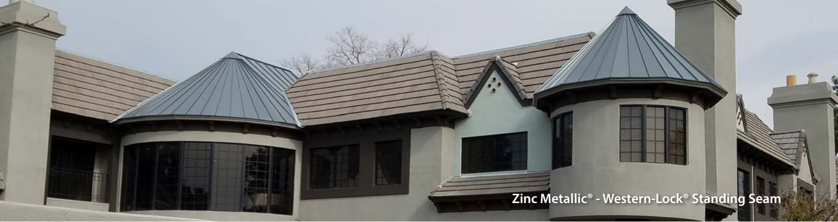
Zinc Metallic® - Western-Lock® Standing Seam