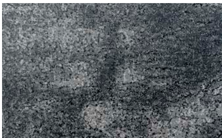
Blackened Steel Matte®

These color samples are as close as possible to actual colors offered within the limits of color reproduction. Substrate subject to change.