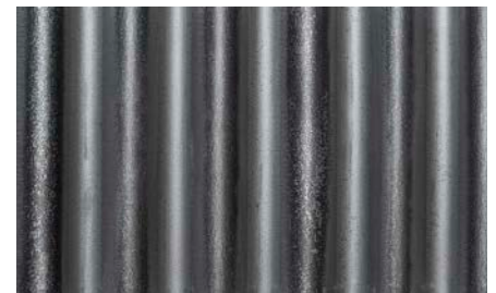
† Streaked Blackened Rust®