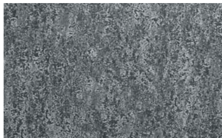
Speckled Blackened Rust®